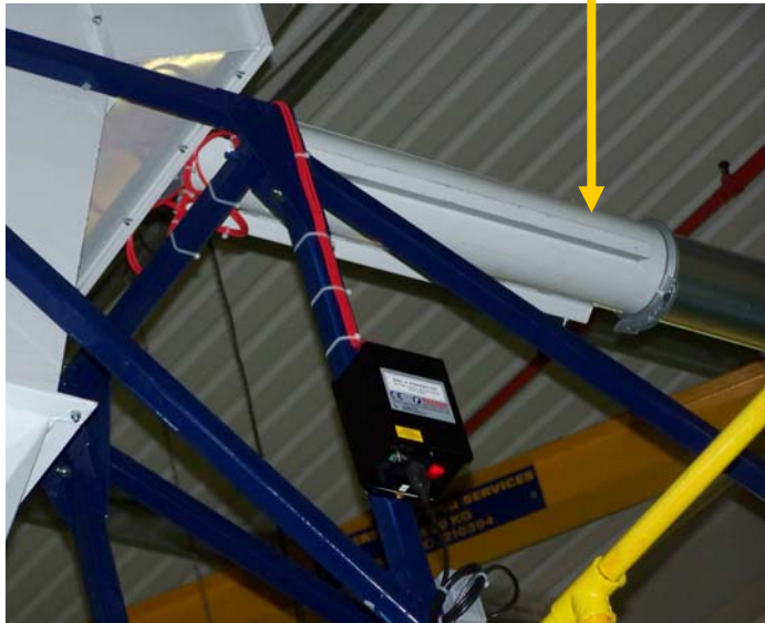
6000 lontube mounted before the separator

These photos show a typical application for the 6000 lontube. The trim and waste caused static problems in the separator and collection bins below it. The lontube was positioned immediately before the separator to neutralise the static charge and allow the waste material to fall into the boxes below.