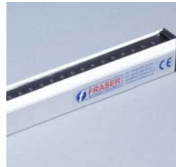
1250-Slot Bar for all of these applications